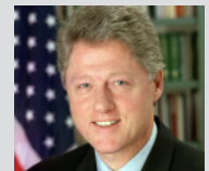
Bill Clinton 1993-2001