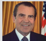
Richard Nixon 1969-1974