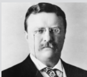
Theodore Roosevelt 1901-1909