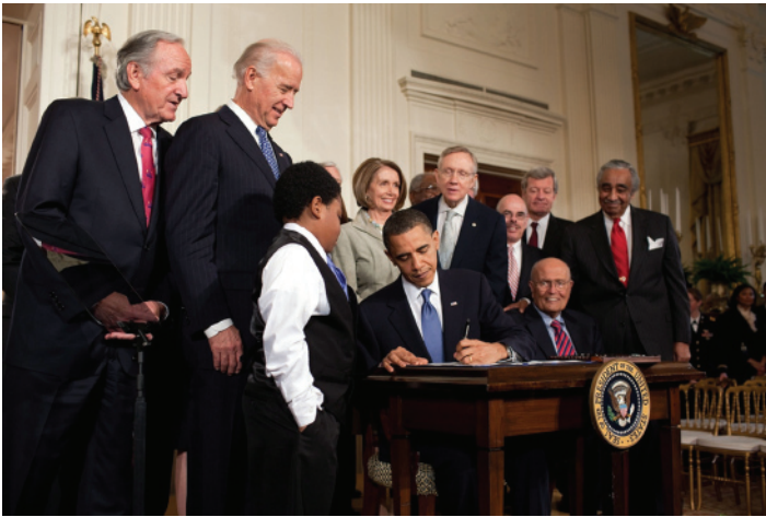
President Obama signing Health Care Reform Bill.

March 21st, the House passed the Senate version of health insurance reform legislation by a vote of 219 to 212—sending it to the President for his signature.