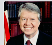
Jimmy Carter 1977-1981