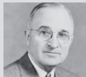
Harry Truman 1945-1953