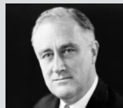
Franklin D. Roosevelt 1933-1945